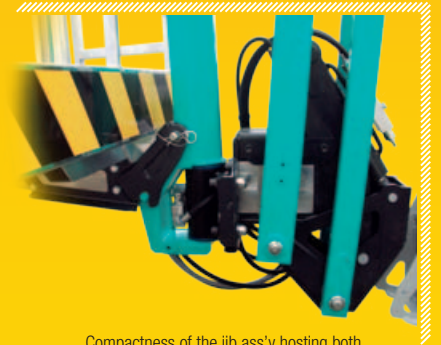
Compactness of the jib ass'y hosting both the load cell and basket rotation system.