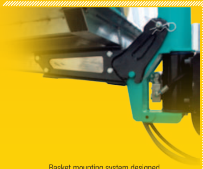
Basket mounting system designed for easiness of assembly.