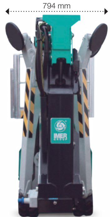
Compact dimensions for enhanced accessibility in any working site.