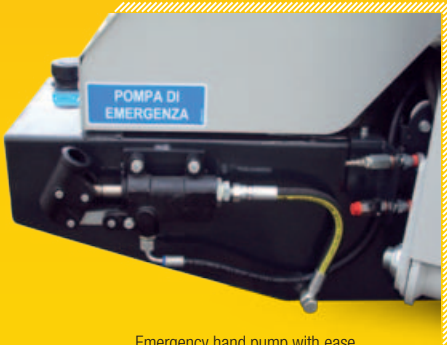
Emergency hand pump with ease of access and operation.