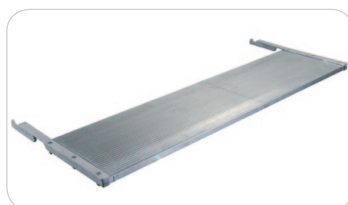
Optional side surface