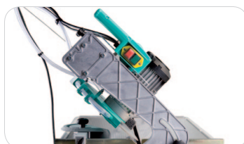
Cutting at 45°