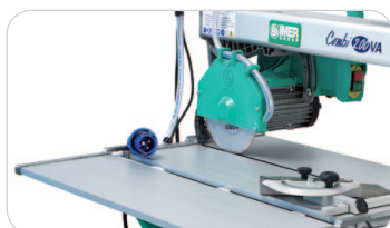
High cutting capacity