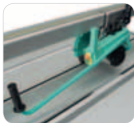
Handle for long cuts (only Combi 250-1500)