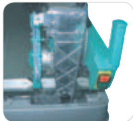
OFF button incorporated in the handle