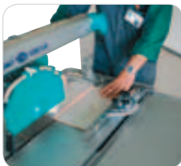
Standard laser pointer