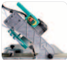
Cutting at 45°