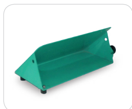
45° meter guide