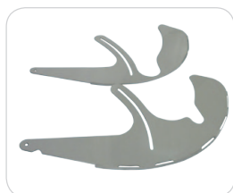
Kit for blade protection