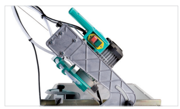
Cutting at 45°