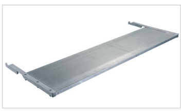
Optional side surface