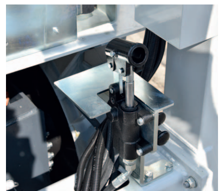
Stabilizers manual descent device