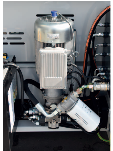
AC electric power unit